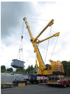
A site overview with the new elevated transformer to the upper left.

On 2 nd October 2018 Electricity North West switched on the new 132/33kV transformer. This means that the works over the summer have progressed as planned with two 132kV transformers and 33kV equipment on the site now at the new elevated position above the 1:1000 year flood level. There is further work planned to follow with the 33/11kV transformers, (the smaller ones on site), but the strategic assets for the city and wider area should now be secure from flood risk.