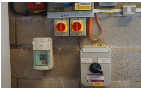
Equipment provided to community groups. Grant funded by the Community Foundation for Lancashire and Merseyside

The grants have been made to purchase emergency equipment and improve the facilities at various local halls to make them more suitable to act as local emergency centres by providing generators and making improvements to electrical supplies, catering facilities etc.