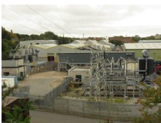
The transformer being craned into position.